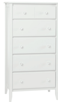
205 5-Drawer Chest 29.75"W x 20"D x 56"H