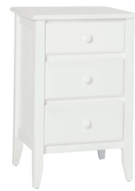
103 3-Drawer Nightstand 19.75"W x 16.5"D x 33"H