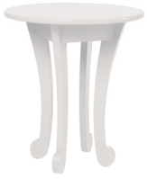
Round Tulip End Table 24-TUL-CIR 21"W x 24"H