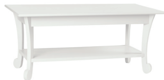
Rectangle Tulip Coffee Table 19-TUL-R-S 44"W x 22"D x 19"H