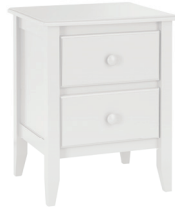
102 2-Drawer Nightstand 19.75"W x 16.5"D x 25"H