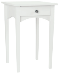
E-NS Evelyn Nightstand 20.75"W x 20.75"D x 30"H