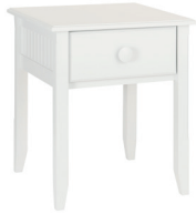
Wide Bay End Table 902 20.75"W x 20.75"D x 24"H