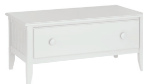
Bay Coffee Table 906 39.75"W x 20.75"D x 18"H