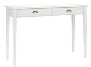
Cove Hall Table 30-TP-R 44"W x 16"D x 30"H