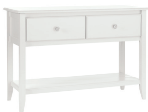
Bay Hall Table 908-S 44"W x 17.25"D x 30"H