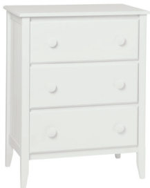
203 3-Drawer Chest 29.75"W x 20"D x 38"H