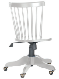
C-285 Adjustable Swivel Chair