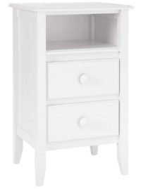
103-OT 2-Drawer Open Top Nightstand 19.75"W x 16.5"D x 33"H