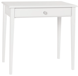
30-WT-TP Writing Table 31.5"W x 20.75"D x 30"H