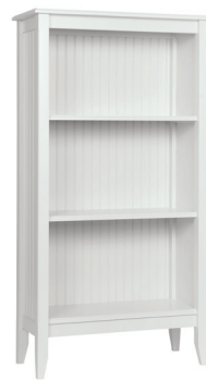
B-205 3-Shelf Bookcase 29.75"W x 12.75"D x 56"H