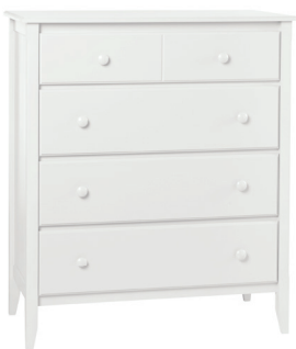
374 4-Drawer Wide Chest 39.75"W x 20"D x 46"H