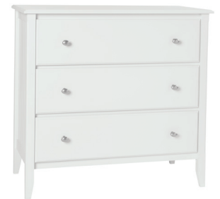
373 3-Drawer Wide Chest 39.75"W x 20"D x 38"H