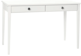
3048-WT-TP Large Writing Table 48"W x 24"D x 30"H