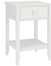
Tall Wide Bay End Table 904 - Available without shelf 20.75"W x 20.75"D x 30"H