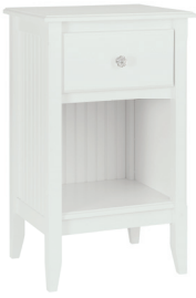
101 1-Drawer Nightstand 19.75"W x 16.5"D x 33"H