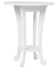
Tulip Bistro Table 30-TUL-B 25"W x 30"H