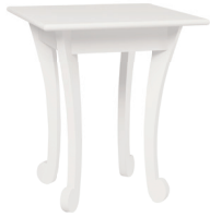
Square Tulip End Table 24-TUL-SQ 20.75"W x 20.75"D x 24"H