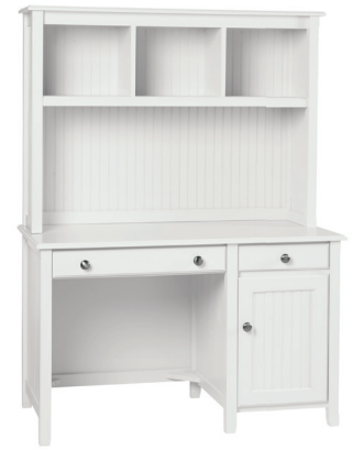
606 + H-606 Pedestal Desk with Cabinet shown with hutch DESK 48"W x 24"D x 30"H HUTCH 48"W x 12.75"D x 35"H