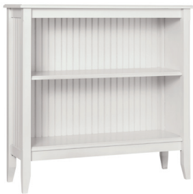
B-373 Low Bookcase 39.75"W x 12.75"D x 38"H