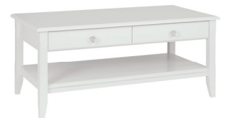
Harbor Coffee Table 19-SQ-R-S 44"W x 22"D x 19"H