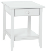
Harbor End Table 24-SQ-R-S 20.75"W x 25"D x 24"H