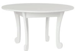
Round Tulip Coffee Table 19-TUL-CIR 34"W x 19"H