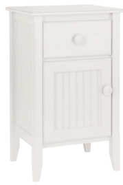
101-D Bedside Cabinet Door available left or right 19.75"W x 16.5"D x 33"H