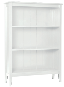
B-375 3-Shelf Wide Bookcase 39.75"W x 12.75"D x 56"H