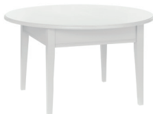
Round Cove Coffee Table 19-TP-CIR 34"W x 19"H