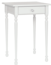
Turned Leg Table 30-TN-SQ 20.75"W x 20.75"D x 30"H

BENCHCRAFTED. BUILT TO ORDER. ONE PIECE AT A TIME. RIGHT HERE IN MAINE.