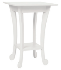
Tall Tulip End Table 30-TUL-SQ-S 20.75"W x 20.75"D x 30"H