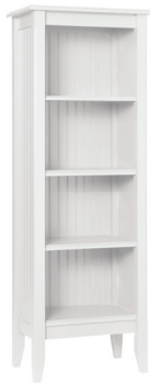
B-106 Narrow Bookcase 19.75"W x 12.75"D x 56"H