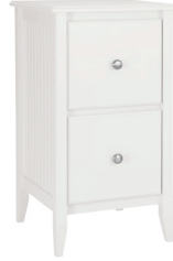
502 2-Drawer File Cabinet 19.75"W x 20"D x 30"H