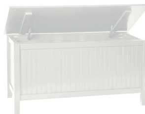
005 Shoreline Blanket Chest 44"W x 20"D x 22"H