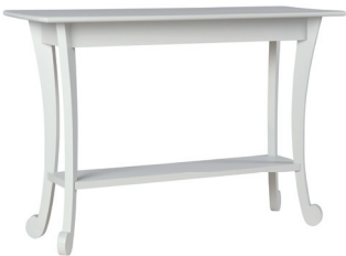
Tulip Hall Table 30-TUL-R-S 44"W x 16"D x 30.25"H