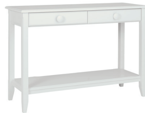
Harbor Hall Table 30-SQ-R-S 44"W x 16"D x 30"H