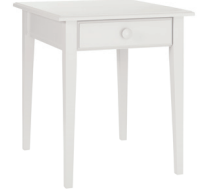
Rectangle Cove End Table 24-TP-R 20.75"W x 25"D x 24"H