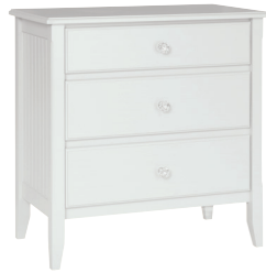
30-30 Bedside Chest 29.75"W x 16.5"D x 30"H