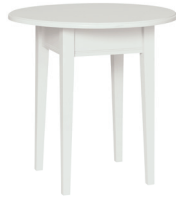
Round Cove End Table 24-TP-CIR 25"W x 24"H