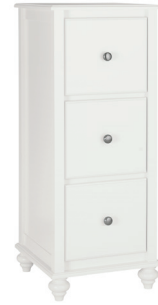
503 3-Drawer File Cabinet shown with bun foot 19.75"W x 20"D x 44"H