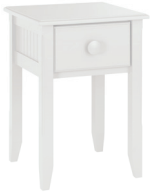
Bay End Table 901 17"W x 17"D x 24"H