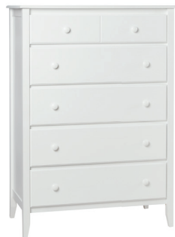
375 5-Drawer Wide Chest 39.75"W x 20"D x 56"H