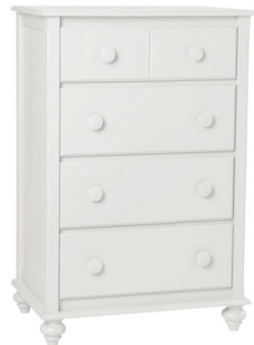
204 4-Drawer Chest shown with bun foot 29.75"W x 20"D x 46"H