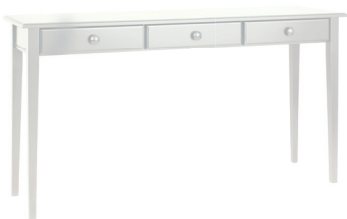
Wide Cove Hall Table 30-3-TP-R 56.5"W x 16"D x 30"H

Standard beds come complete with headboard, footboard, side rails and support slats. Full, Queen and King sizes include center slat support. Side rails attach to the headboard and footboard with steel brackets that are easy to assemble. Box spring and mattress are not included.