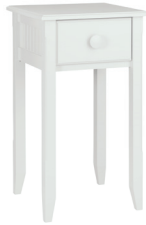
Tall Bay End Table 903 - Available with shelf 17"W x 17"D x 30"H