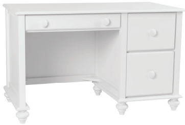
605 2-Drawer Pedestal Desk shown with bun foot 48"W x 24"D x 30"H