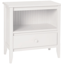
30-30-S Open Top Bedside Chest 29.75"W x 16.5"D x 30"H