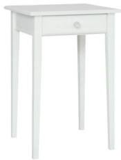
Cove Tapered Leg Table 30-TP-SQ 20.75"W x 20.75"D x 30"H