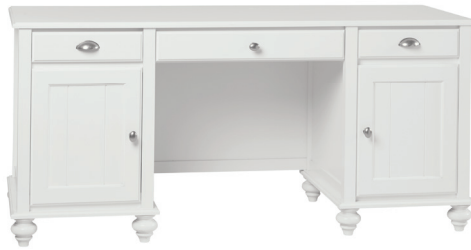
606-D Double Pedestal Desk with Cabinets shown with bun foot 64.75"W x 24"D x 30"H